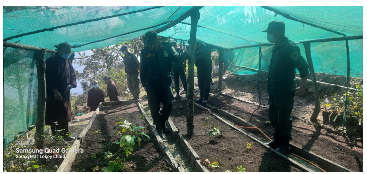
Figure 2: Exiting nursery with few Paris polyhylla in Deptsang visited by Honorable Director DoFPS and ED BFLFS.

The activity will have Positive impact since the Farmers in the group are going to cultivate the species in large scale in the nursery and if it is successful, the group have a plan to produce seedlings for distribution on top of cultivation for sale to other interested farmers and others. This will only decrease the pressure on collection of NTFPs by the group and other community members as well.