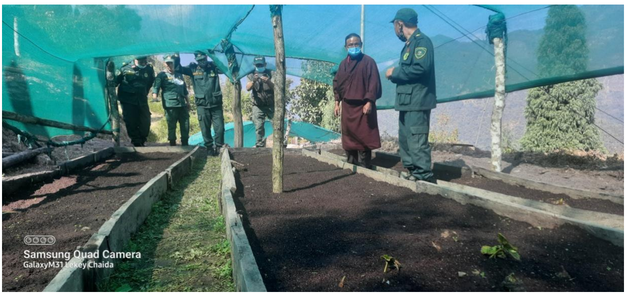
Figure 1: Nursery which they want to upgrade for Paris polyphylla